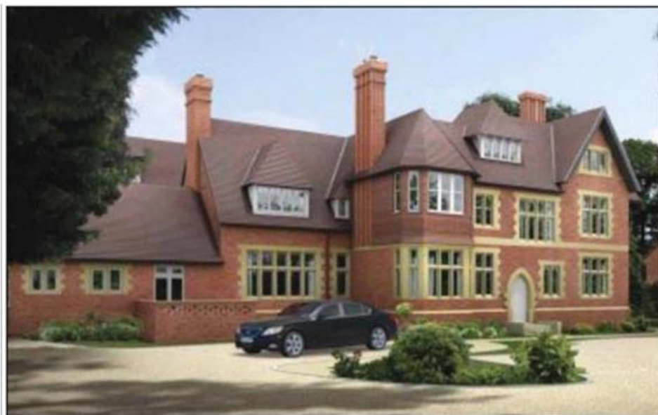
Vision: an artist's impression of how the new care home would look if the planning application by new owner Urban Village Group is successful

Date: 17/06/2022 Page: 19 Reach: 8998 Value: 530.1000