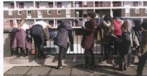
Editor's Award: The judges described Hackney's child-friendly SPD as an "exceptional project"