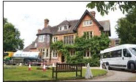
Empty: Eastfield House has not been used since the care home shut in 2013

Public consultation will run until July 1. To see the application, visit https://data.southoxon.gov.uk/ccm/support/Main.jsp?MODULE=ApplicationDetails&REF=P22S1689/FUL .