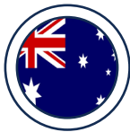
AUD Australian Dollar