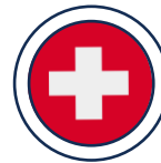
CHF Swiss Franc