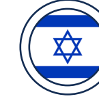
ILS Israeli Shekel