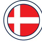
DKK Danish Krone