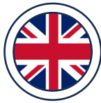
GBP British Pound