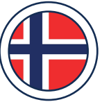
NOK Norwegian Krone