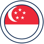
SGD Singapore Dollar