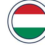
HUF Hungarian Forint