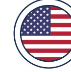
USD United States Dollar