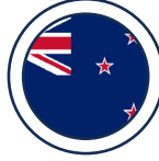
NZD New Zealand Dollar