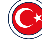
TRY Turkish Lira