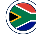
ZAR South African Rand

United Arab Emirates Dirham Australian Dollar Bahraini Dinar British Pound Canadian Dollar Swiss Franc Czech Republic Koruna