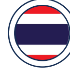
THB Thailand Bhat