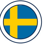
SEK Swedish Krone