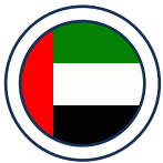
AED United Arab Emirates Dirham