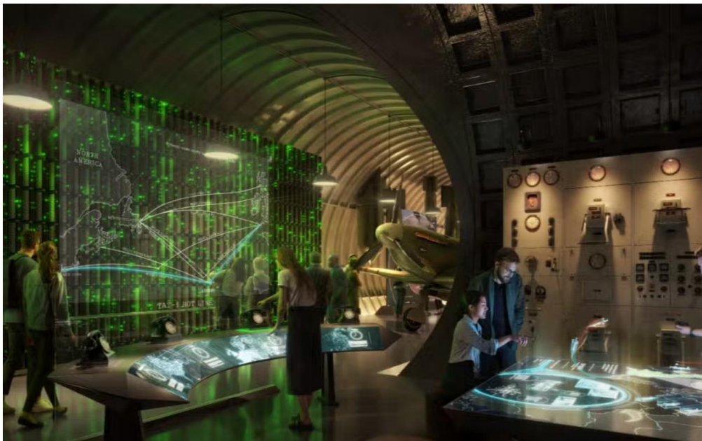
HOW THE KINGSWAY TUNNELS COULD LOOK

The plans now need the go-ahead from neighbouring Camden Council