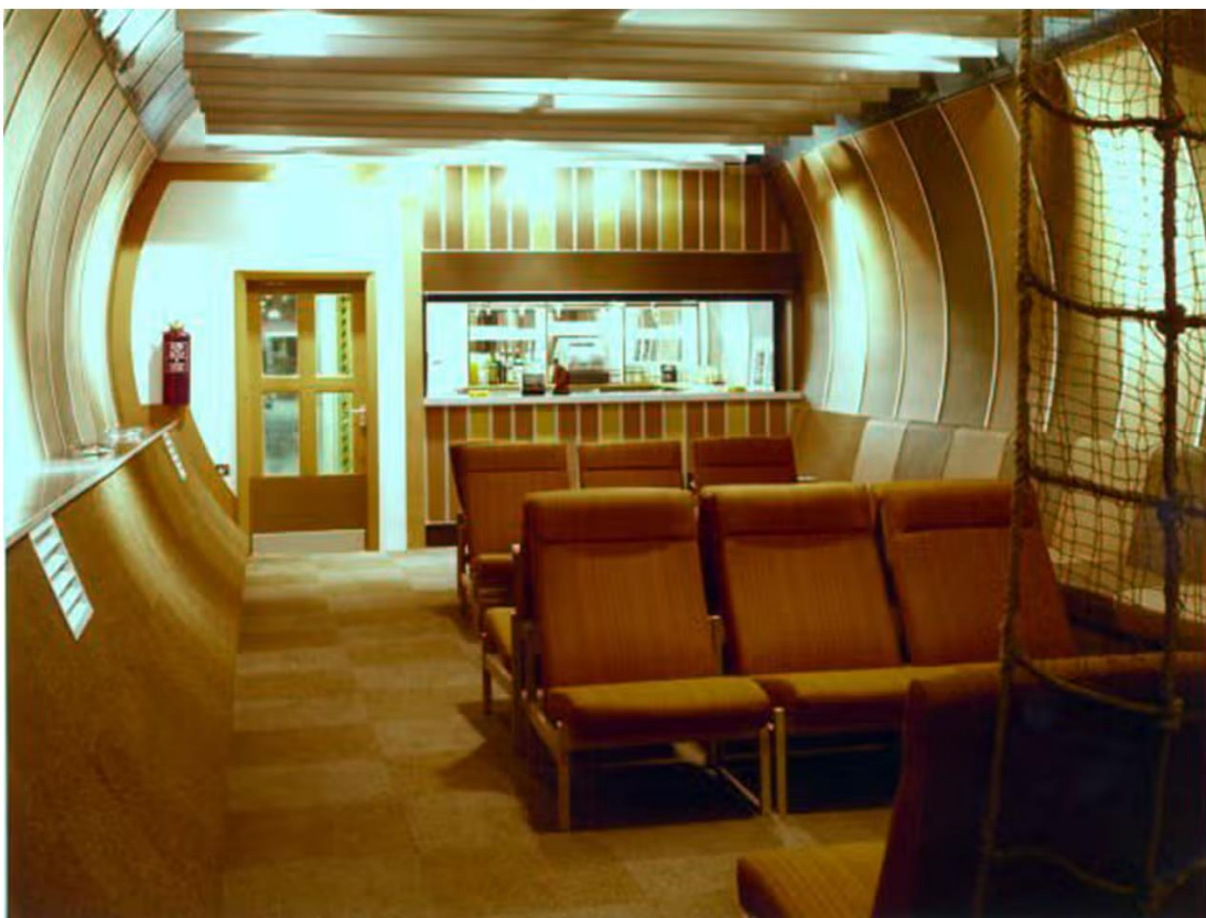
THE KINGSWAY TUNNELS WHILE USED BY BT

As the threat of mass enemy bombing receded, they were used by the wartime government as a secret telecommunications centre and base for the Special Operations Executive (SOE) which parachuted agents behind enemy lines after being instructed by Winston Churchill to “set Europe ablaze”.