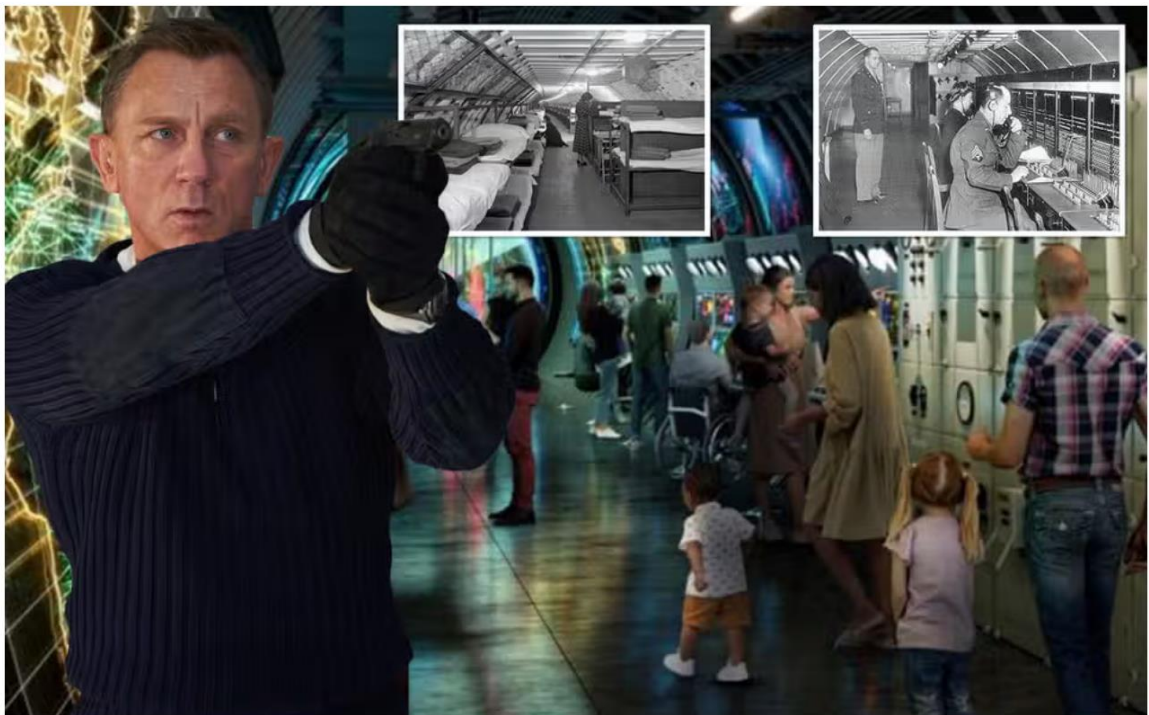
JAMES BOND AND THE PROPOSED KINGSWAY TUNNELS

"As we work to transform the Square Mile into a seven-day-a-week destination, developments like the one proposed for the Kingsway Tunnel site will become global attractions for a variety of visitors, which are projected to rise substantially."