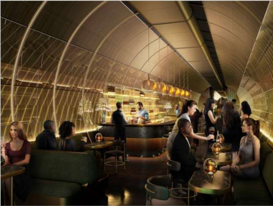
Deepest bar in UK, celebrating what used to be the staff canteen when the tunnels were in operation.

The centre is expected to bring an estimated £60-85m of extra footfall spending to the local area, per year.