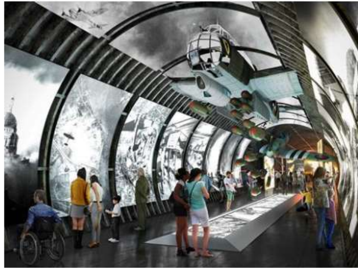
The tunnels are expected to bring in two million visitors a year

Historic England noted that the scheme sits near Barnards Inn, where solicitors traditionally practiced and underwent training until the 19th century. The body said that scheme does not physically interfere with the inn but recommended that extra care should be made to maintain ease of access to the building.