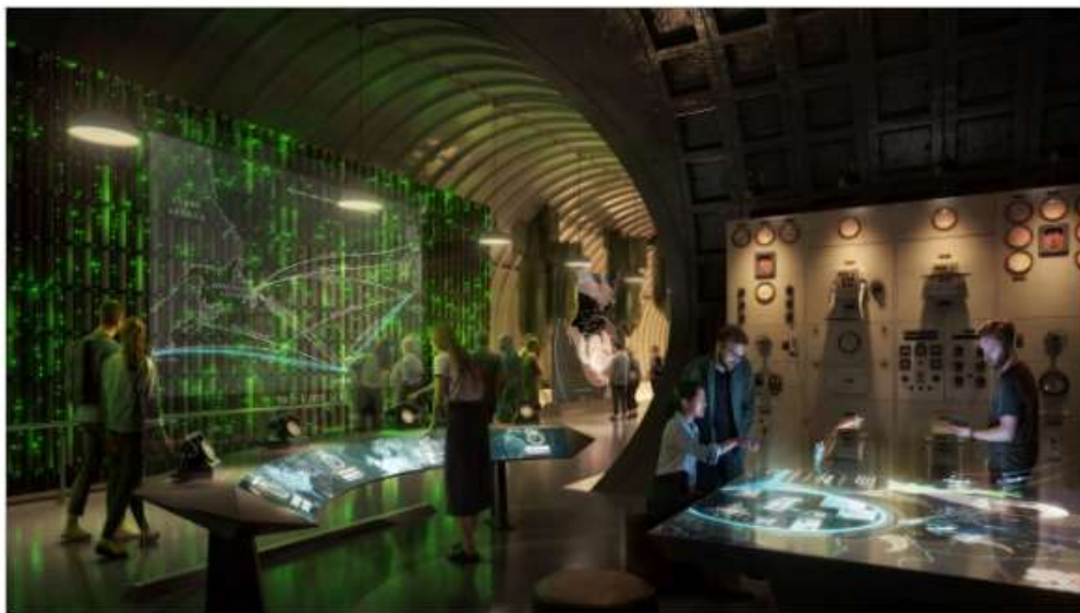
Heritage Exhibition will reveal and celebrate the history of the tunnels and their role in WWII and the Cold War

007 creator Ian Fleming worked in the tunnels as liaison officer to the SOE and in his first Bond book "Casino Royale" referenced them as the location for M's Q Branch gadget development labs.