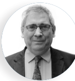
Mark Latham Strategist