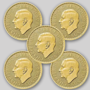
KING CHARLES 1/20Z, 5 COIN BUNDLE

UK minted gold coins offer some unique tax advantages, especially to UK taxpayers, including Capital Gains Tax (GCT) relief, making them a very useful asset class within a diversified portfolio.