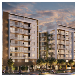
ELEVATE / DANIA BEACH MULTI-FAMILY | Dania Beach, FL