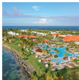
GRAND RESERVE HYATT REGENCY HOSPITALIDAD | Rio Grande, PR