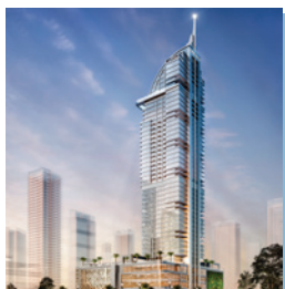
LEGACY HOTEL & RESIDENCES USO MIXTO | Downtown Miami, FL