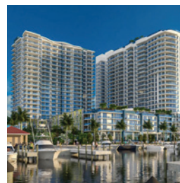
NAUTILUS 220 USO MIXTO | Palm Beach, FL